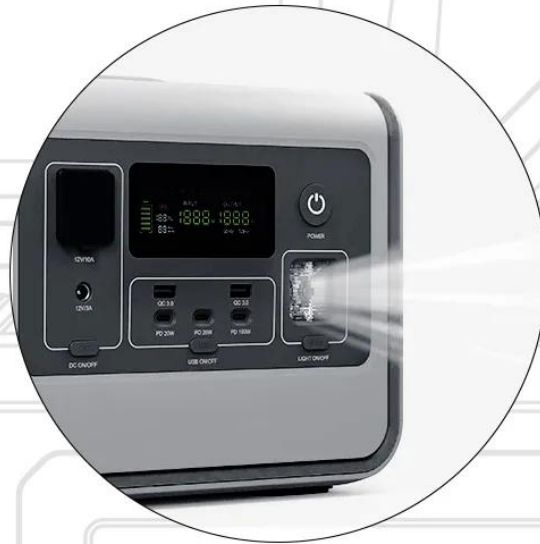
Built-in LED Light