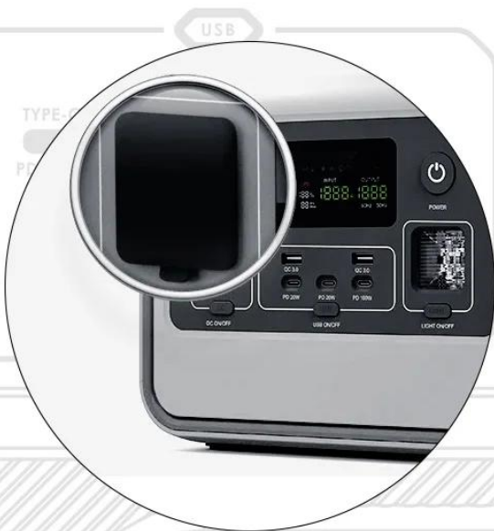
Dust-resistant Rubber Plug