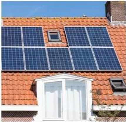
Home energy storage