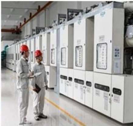
Home energy storage