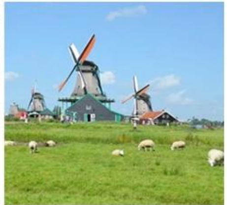
Agricultural energy storage