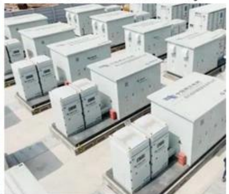
Utility grid/Ups systems/