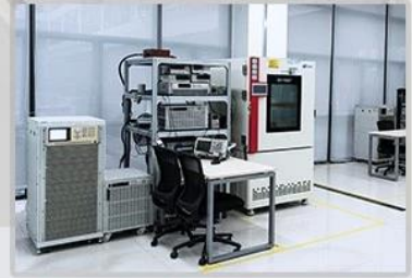
Electrical & Electronics Test Room