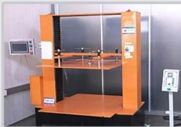
Drop Test Room