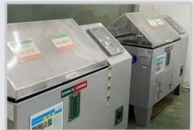
Salt Spray Test Room