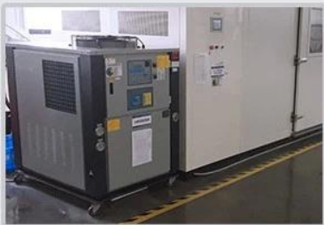
Aging Test Room