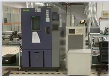
Environmental Test Room