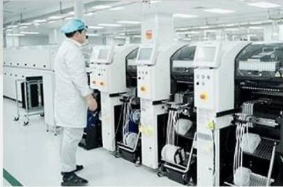
SMT Production Line