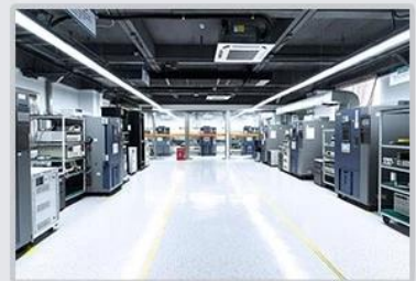
Humidity & Temperature Test Room