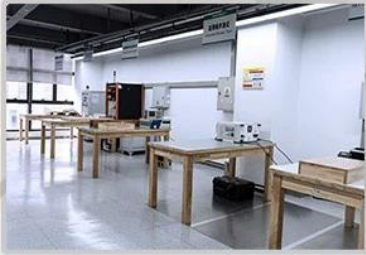
EMS Test Room