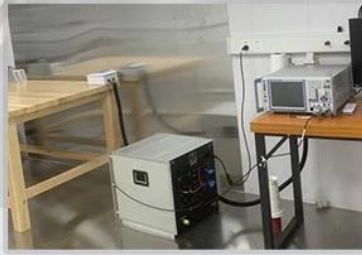
EMI Test Room