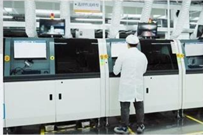
Power Supply Production Line