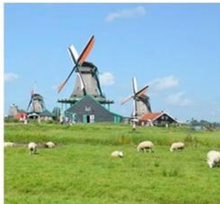
Agricultural energy storage