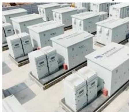
Utility grid/Ups systems/