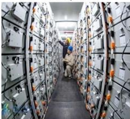
Industrial energy storage